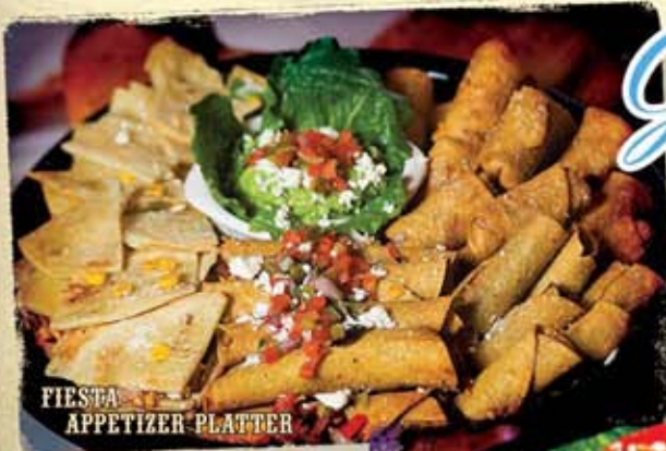
FIESTA APPETIZER PLATTER