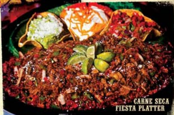
CARNE SECA FIESTA PLATTER